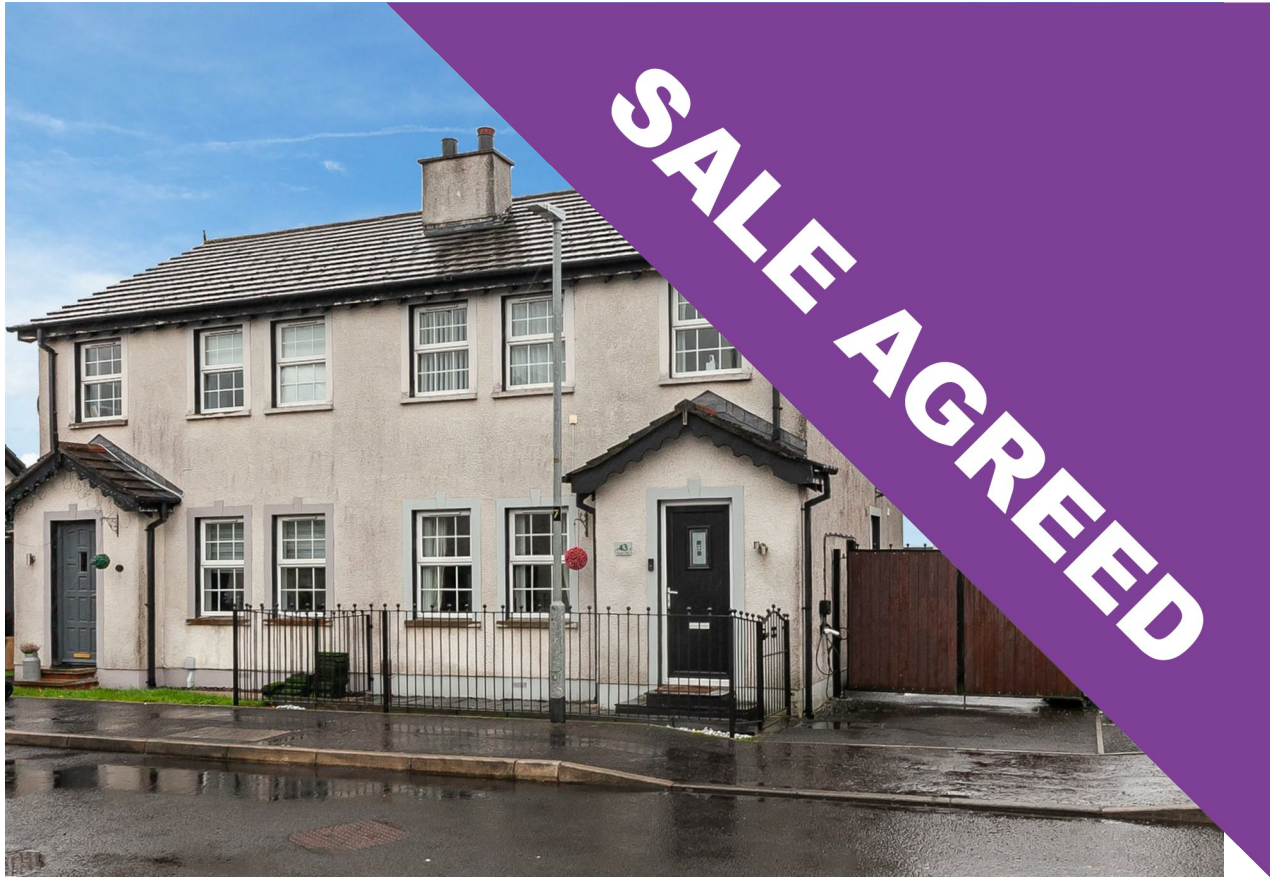
43 Braden Glen, Newtownabbey, BT37 9BG